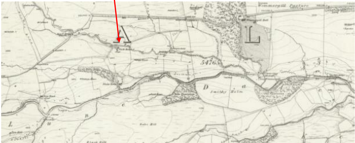
OS map of Lunedale 1856