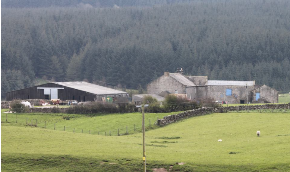
West Hope Farm, Barningham (2013)