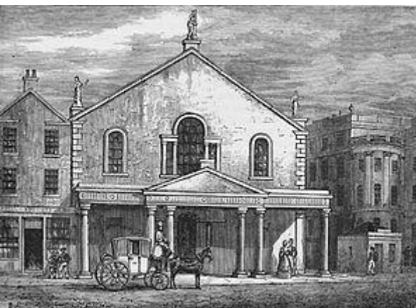
The first Theatre Royal, Edinburgh (per Wikipedia)

TI house. about t Edinbu houses for the residen as can The