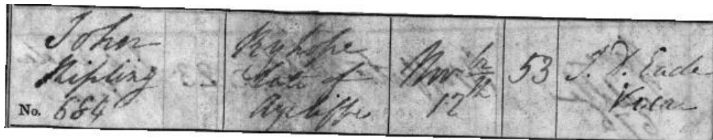
Burial Register (BT), Aycliffe, 1839