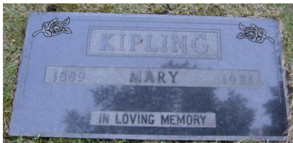
St Mary's cemetery, Calgary

Excerpt from The Calgary Herald , June 28, 1971, page 41