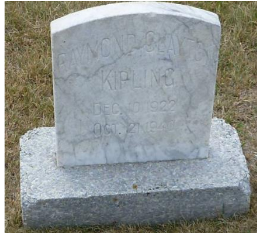
St Mary's cemetery, Calgary