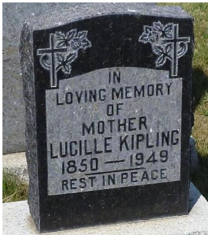
St. Mary's, Calgary, Calgary, Alberta