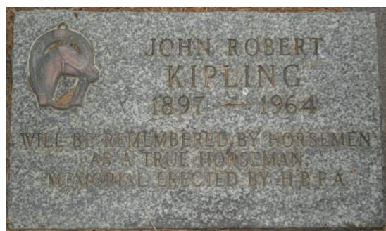
St Mary's cemetery, Calgary