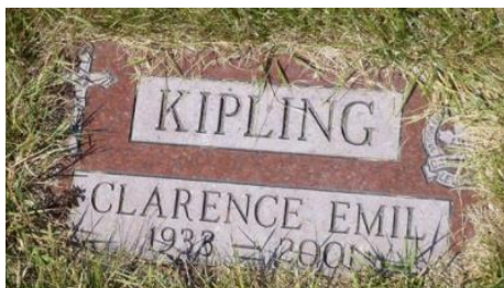
St. Mary's, Calgary, Calgary, Albert