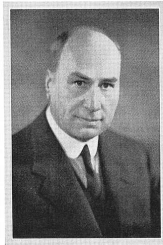
Burnley Express - Wednesday 19 January 1910