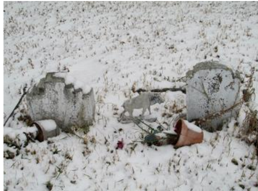
Roman Catholic cemetery, Ile de la Crosse