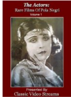
The Spanish Dancer (1923)