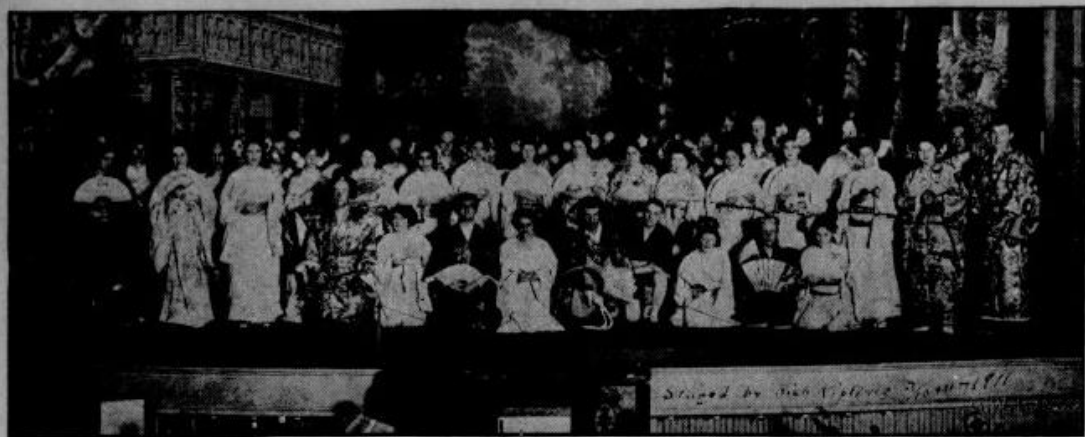
SCENE FROM GILBERT & SULLIVAN'S OPERETTA, "THE MIKADO," TO BE PRESENTED AT COLUMBIA THEATER, APRIL 16 AND 17, UNDER THE AUSPICES OF SANTA ROSA LODGE, NO. 646, BENEVOLENT AND PROTECTIVE ORDER OF ELKS.