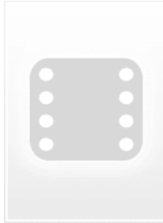
The Price of Success (1925)