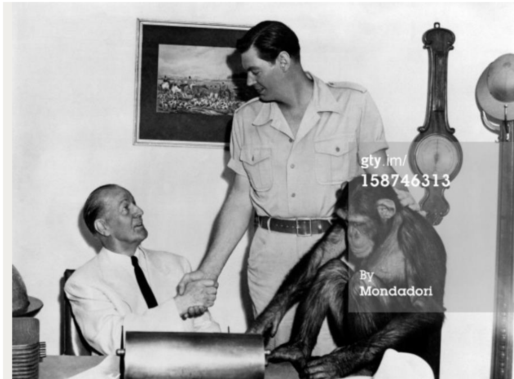
Title: Johnny Weissmuller and Richard Kipling in Voodoo Tiger

Caption: American actor and swimmer Johnny Weissmuller (Janos Weissmueller) beside a chimpanzee shaking hands with American actor Richard Kipling in the film Voodoo Tiger. 1952