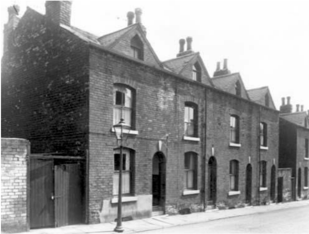
Nippet Terrace, Leeds c 1960 (38 is the right hand of the block of four)